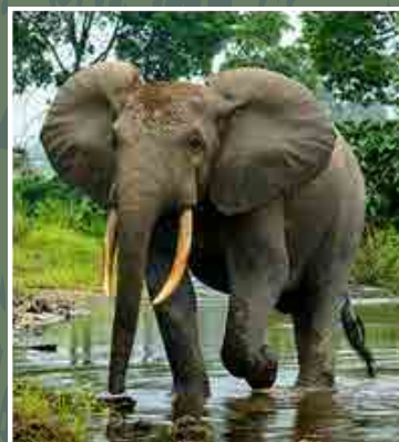
African Forest Elephant