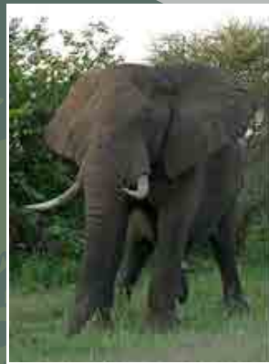
African Bush Elephant

Elephants can be classified into two main genere; Loxodonta and Elephas . African elephants belong to the genus Loxodonta , while Asian elephants are categorized into the genus Elephas . African bush/savanna elephant ( Loxodonta Africana ) and the African forest elephant ( Loxodonta cyclotis ) are main