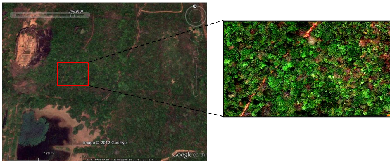
Figure 3: Canopy of the Sigiriya dry zone forest during the dry spell. Light green color patches on the canopy are the new flush. High spatial resolution images were acquired from Google Maps and Google Earth.

From the satellite data, it was observed that there was a leaf flush with canopy green-up in the dry zone forest (Figure 3). However, in the arboretum a leaf flush was not visible due to small size of the site. An unusual above ground leaf flush has also been observed in Amazon forests in an extreme drought (Berlin et al. , 2000; Saleska et al. , 2007). Pau et al. (2010) have also identified Hawaiian rainforest green-up in responses to seasonal and El Niño-driven droughts. Nutrients required to grow the canopy during the drought may also have been supplied from the soil labile C decomposition, as mentioned above.